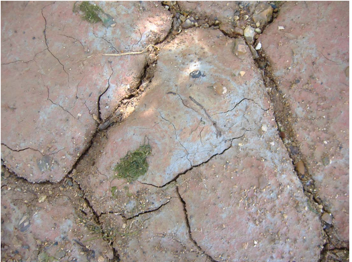
Marl from the Reading Beds, Dell Quay