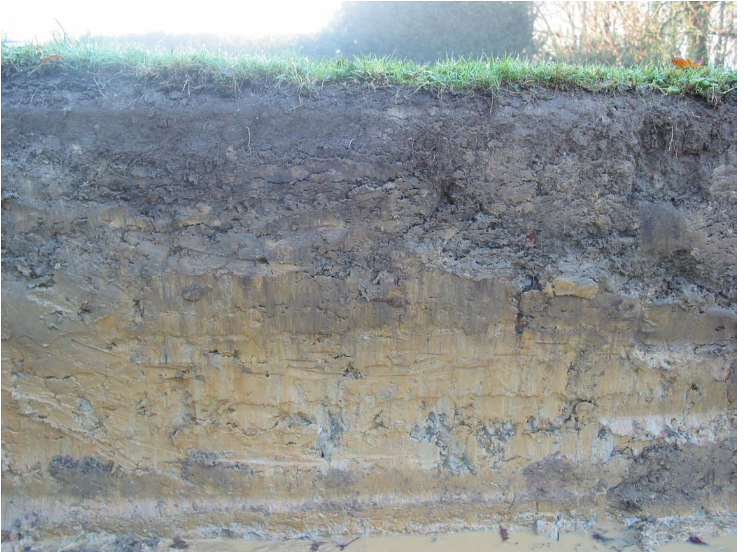
Marl from the Weald Clay, near Horsham